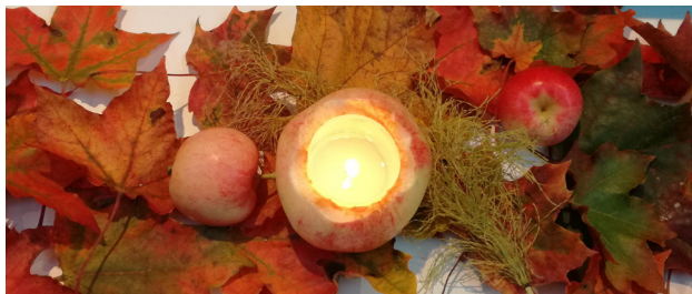
our table decoration at the party

A few weeks before leaving your home, besides excitement you might be afraid too - at least I was! There are many unanswered questions ahead you: what if you fail making new friends? How to deal with homesickness? Not to mention that you will have to challenge your problem solving skills. (It sounds terrifying at first...) But don't worry, these doubts will pass by after some days! And for sure, you will find helping hands in Finland!