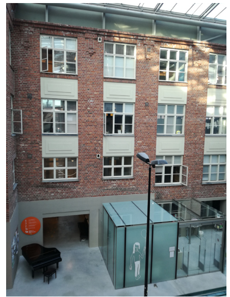
view from the 3rd floor